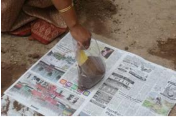
Label with required information